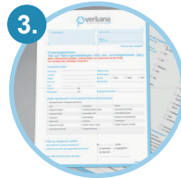
1 Sample dispatch note