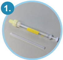
1 Urine monovette