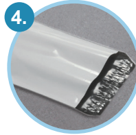
1 Return envelope