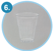
1 Collection cup