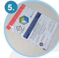
1 Specimen bag